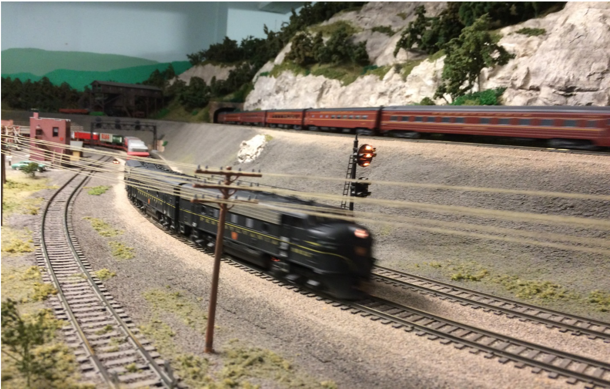
PRR Truc Train speeds along as PRR passenger train enters mountain tunnel above.