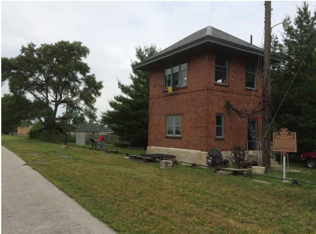
June 2016 'Bradford Heritage' Festival. Historic "BF" tower saved.

===Special 2016 Photo Edition=== [Section 1 of 2]