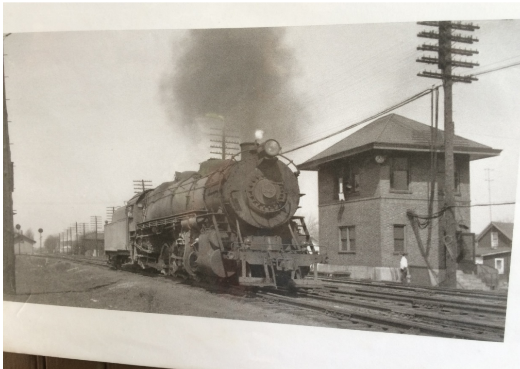
N2 #7962 East Bound PRR light engine ‘chuffs’ past “BF” Tower. April 20, 1952.